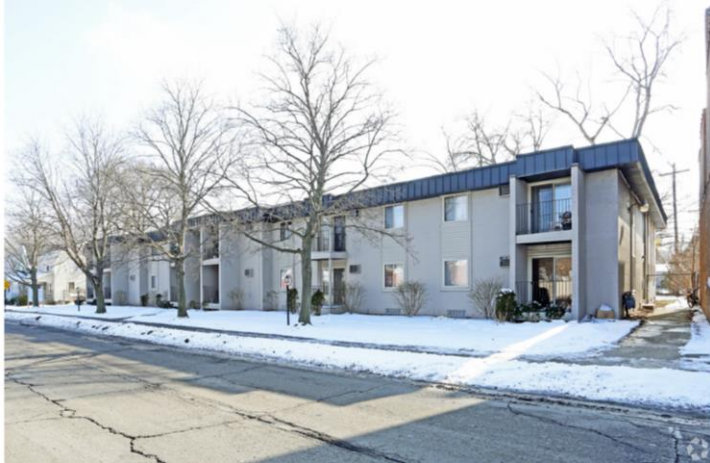
Marshall Place Apartments

I like the Marshall Place Apartments on W. Marshall at La Prairie. They are a decent size at two stories, they are compatible, do not block the view of the neighbors, and fit Ferndale's style. Development should fit into Ferndale's character.